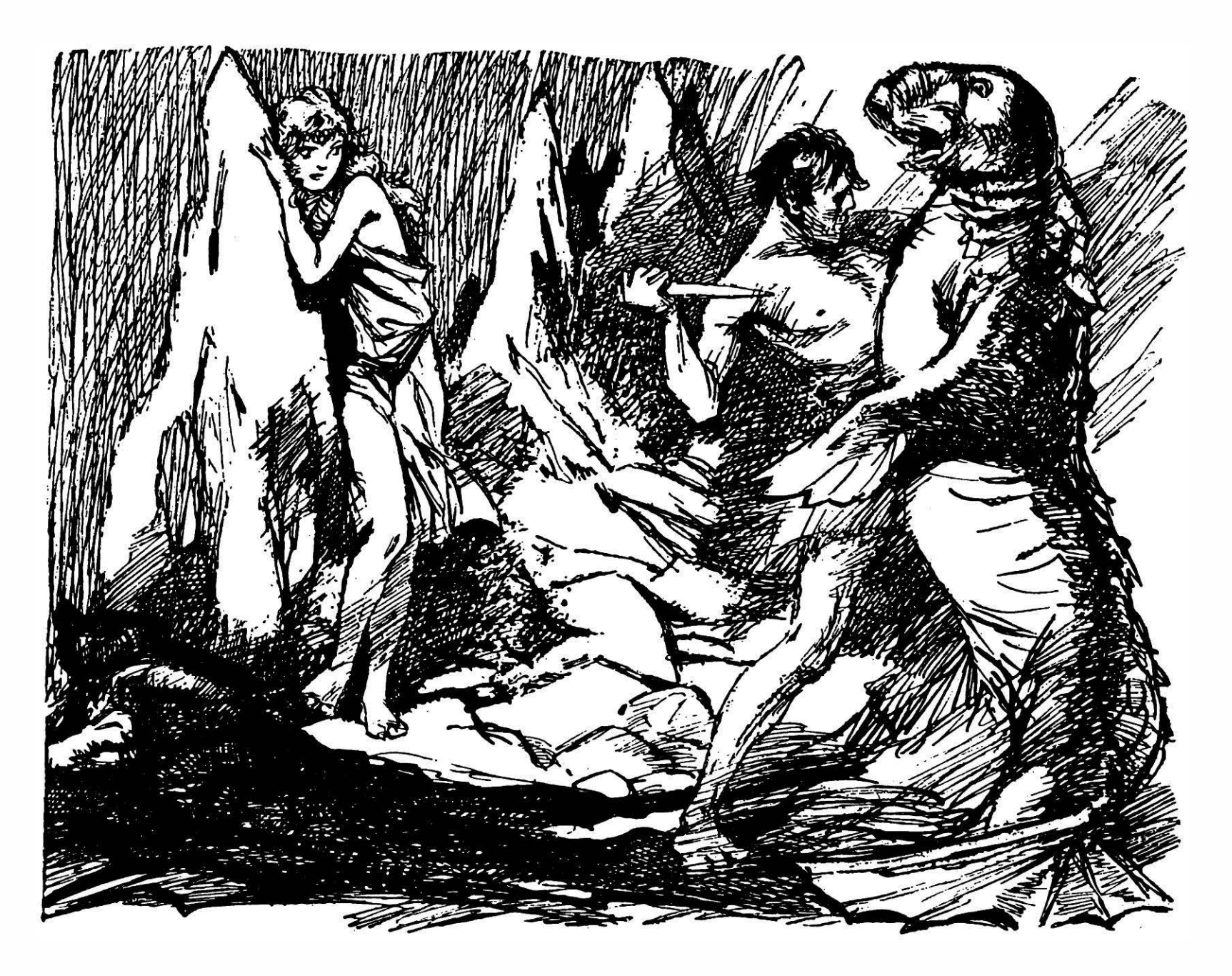
Deeper Into the Nightmare Chambers of the Himalayas Plunge the Strange Three_Morgo, Nurri Kala and McRory the Red.